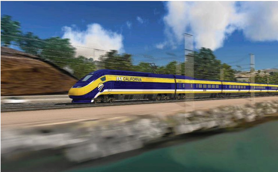
An artist's rendering of the high-speed rail line.

The state high-speed rail authority took another key step Thursday in building the initial segments of the bullet train system between Los Angeles and San Francisco, saying it had preliminarily selected a team of contractors for another 65 miles of the route through the Central Valley.